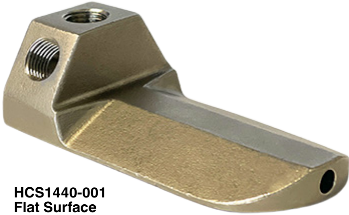
HCS1440-001 Flat Surface