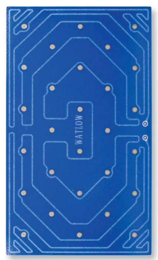
Large panel thick film heater