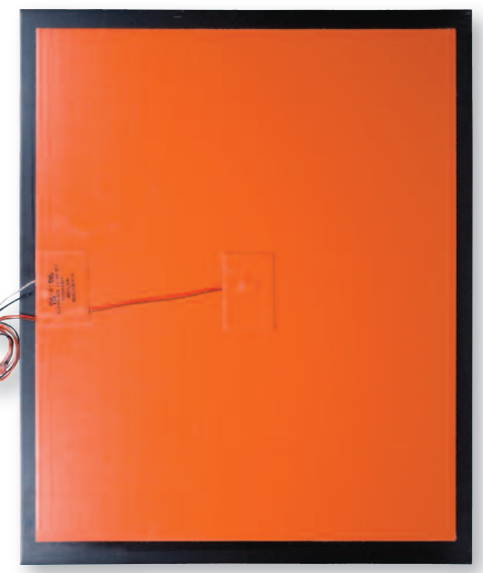
Foil circuit heaters