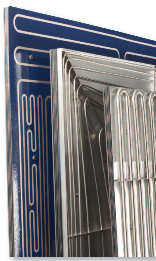
Variety of flat panel radiant heaters