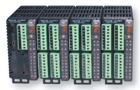
EZ-ZONE RM rail mount controller