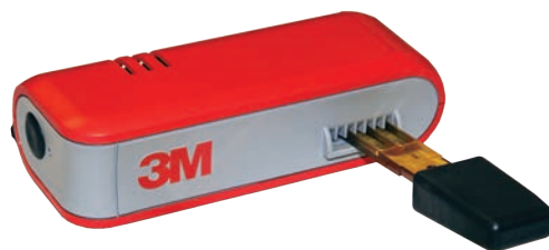
3M Sky Products are approved by both Boeing and Airbus specifications.