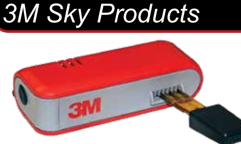
3M Sky Products are approved by both Boeing and Airbus specifications.

*AOG orders must be received by 11am (PST) in order to allow sufficient processing time for same-day shipment. International AOG shipments are subject to space availability on the next flight out. Additional fees may apply. **Five yard minimum order