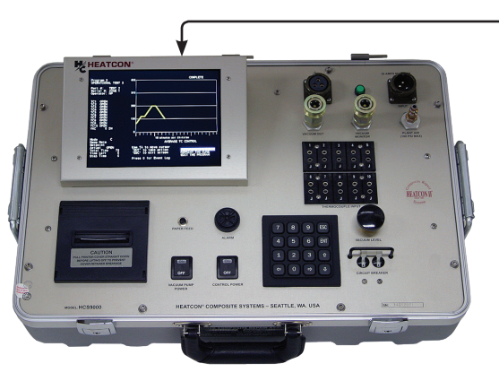
Model: HCS9000B-EV (Single Zone)